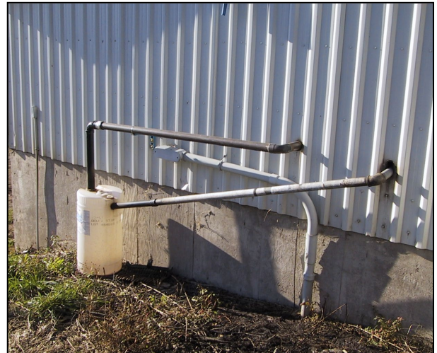
Figure 2: Collection system for two vacuum pumps